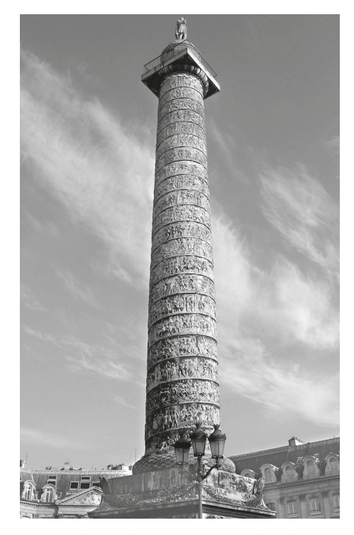
Fig. 2. Vendôme column. Paris. 2011

he decided to erect his column in the centre of the Place Vendôme in Paris, based on the model of Trajan's Column (1806-10) (Fig. 2)<sup>2</sup>. Its shaft was covered by a bronze spiral made from the cannons of the armies defeated at Austerlitz. At that time, Napoleon possessed all the requisites to claim the same glory that had been given to Trajan when his column was constructed: he was a divus, an emperor who had demonstrated his capacity as a leader in battle; his politics derived from the ideals that had led France to revolution [14]. It was in fact in the guise of Caesar imperator that August Dumont represented him in the statue at the top of the monument [35]. Although erected to celebrate Napoleon's military exploits, the Vendôme Column is not called the "Napoleonic Column". After first taking the name "Column of Austerlitz" and "Column of Victory", Napoleon formally expressed his desire to dedicate the monument to the Great Army, as the inscription on the base reveals<sup>3</sup>. The 1789 insurrection brought a change within the society of the time. The emperor no longer found himself, as in the Trajan era, in front of subjects who were immersing themselves in the sovereign celebrated in the frieze of the column bearing his name.