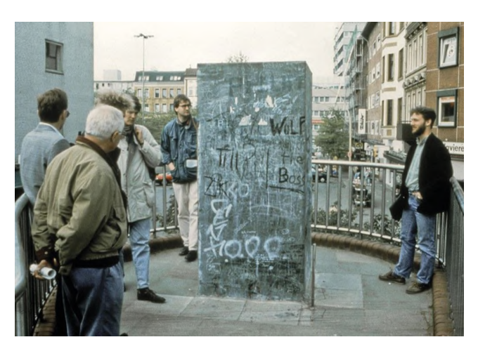
Ill. 69. Esther Shalev-Gerz and Jochen Gerz, Monument Against Fascism, permanent installation in public space, Hamburg-Harburg, Germany, detail of the almost underground column, 1992