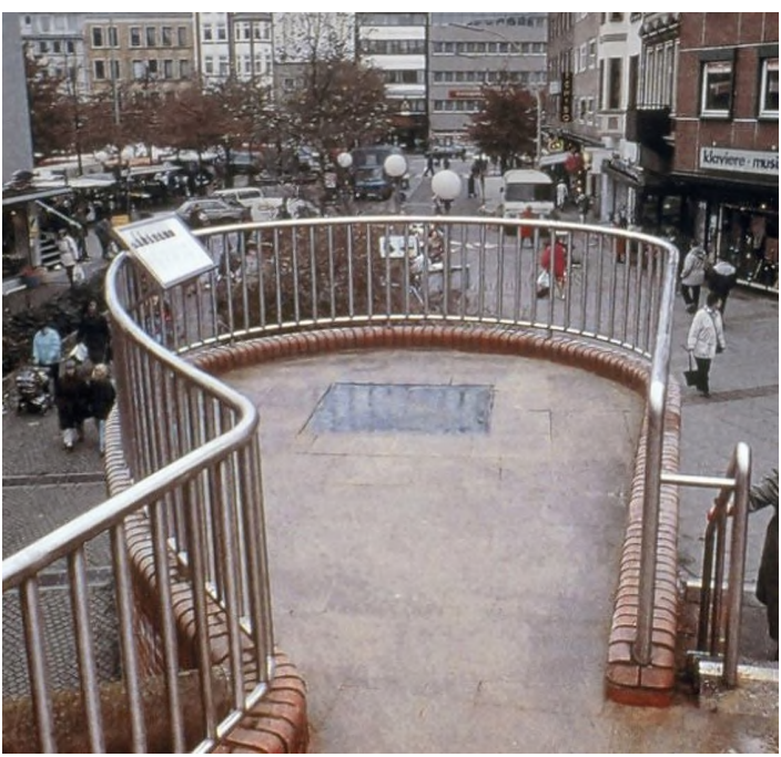
Ill. 70. Esther Shalev-Gerz and Jochen Gerz, Monument Against Fascism, permanent installation in public space, Hamburg-Harburg, Germany, detail of the disappearance, 1993