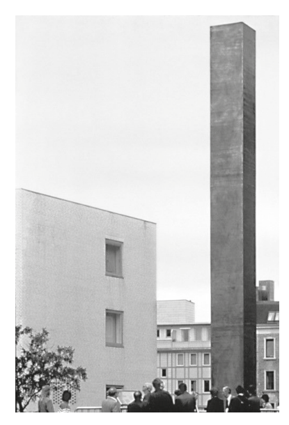
Fig. 4. Esther Shalev-Gerz and Jochen Gerz. Monument Against Fascism, permanent installation in public space, Hamburg-Harburg, Germany, 1986 © Studio Shalev-Gerz

a population that certainly did not have the desire to perpetuate memory forever but the vital need to rework mourning and promote processes of reconciliation [6; 31; 32; 33]. The most important aspect that marks the natural evolution of a monument is the crisis of the concept of duration in time that leads to the birth, in parallel, of the counter-monument [43]. Eternity has always been a fundamental attribute for a memorial but in our time, defined as "fluid" in Bauman's theories, the search for eternity is no longer appropriate [7]. The historiated column erected in Hamburg in 1986 by Esther Shalev-Gerz and Jochen Gerz - Monument against Fascism (1986-1993) — is a counter-monument (Fig. 4). It is a twelve-metre-high clad in lead completely smooth pillar with a one square meter base, on which the inhabitants of the city are invited to sign or write their history against dictatorship and war (Ill. 68). After the accessible part of the column is signed, it is plunged into the ground until it disappears (Ill. 69, 70).