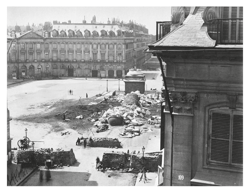
Fig. 3. Felling of the Vendôme column. Paris. 1871. Photo by Franck © Wikimedia commons. Available at: https:// it.wikipedia.org/wiki/Gustave_Courbet?uselang=it/media/File:Franck,_Colonne_Vend%C3%B4me,_1871.jpg