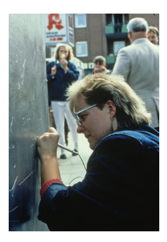
Ill. 68. Esther Shalev-Gerz and Jochen Gerz, Monument Against Fascism, permanent installation in public space, Hamburg-Harburg, Germany, detail of a woman signing, 1986