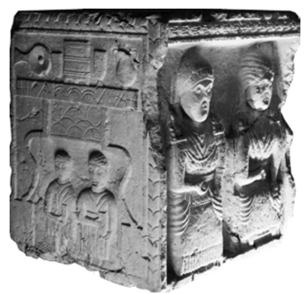
Fig. 5. Funerary monument from Seca Reka.

Particular influence of indigenous cultures on the sculptural and statuary works and compositions of the 2<sup>nd</sup> and the 3rd centuries can be observed on finds from the south-western parts of Central Balkans' Roman provinces, for example from the localities Kolovrat [1, pp. 227-231] and Komini (known also as Municipium S). The sculptures and reliefs from these sites bear striking iconographical similarities to the works of art from the surroundings of Salona in the coastal region of the province Dalmatia. Systematic archaeological excavations combined with the analysis of onomastics and material culture [14, pp. 227-234], showed that the iconographical and stylistic parallels between the sculptures and statues of two distant areas are the