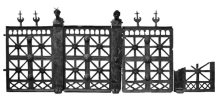
Fig. 8. Bronze railing with herms of Luna and Aesculapius from Mediana Naissus Nis.