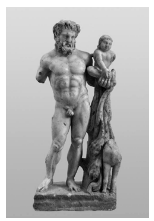
Fig. 6. Herakles with Telephos from Singidunum.

tral Balkans' Roman provinces. Their sculptors came from big centres in Greece, Italy and Asia Minor and established workshops in Central Balkans' Roman cities, like Viminacium, Singidunum, Scupi and imperial residences like Felix Romuliana and Mediana near Naissus. But in time a certain degree of iconographic syncretism can be confirmed in their output. The sculptures, however, which were produced on the request of the local elite and were made to adorn monumental public buildings, imperial estates and private villas of rich individuals, represent the highest artistic achievements of Roman sculpture of the time, inclining to the idealization of the image and beauty of the human body. This can be perceived in the head of Heracles found in the south-eastern part of the Jupiter temple in Felix Romuliana, probably modelled after the famous statue of Heracles Farnese [7, pp. 96–97, fig. 27], the head of an emperor from Karataš on Danube Limes (perhaps Albinus?) [23, pp. 30–31, fig. 7], Jupiter enthroned, with an eagle beside his left leg from locality Kostol (Pontes) [5, pp. 48–50] and Heracles with Telephos from Singidunum [7, pp. 95–96, fig. 23] (Fig. 6). The turbulent pe-