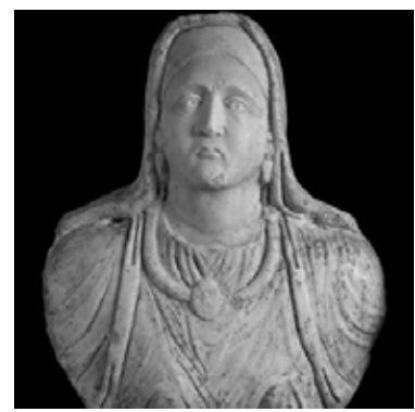
Fig. 4. Bust of a woman from Klokot. Available at: https://www.birmingham. ac.uk/schools/historycultures/ departments/caha/events/2017/ seminar-mladenovic.aspx © D. Mladenović