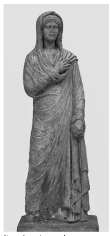
Fig. 2. Draped woman from Singidunum.

prevailing [16, p. 6]. After the provinces were constituted, indigenous inhabitants were assigned to administrative units called civitates peregrinae . However, as A. Mócsy rightly points out, the territories of the civitates didn't always correspond with the size of the areas where certain tribes lived in the period before the Roman reign [16, pp. 68–69]. This had its consequences in the later diffusion of Roman culture, art and religion throughout Roman provinces of the Central Balkans.